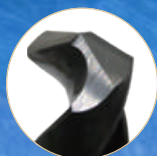
Two Rake + X Shape