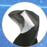
Corn + X Shape