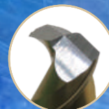
Deep Hole Rake + R Shape