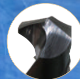
Two Rake + SX Shape