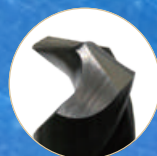
Two Rake + R Shape